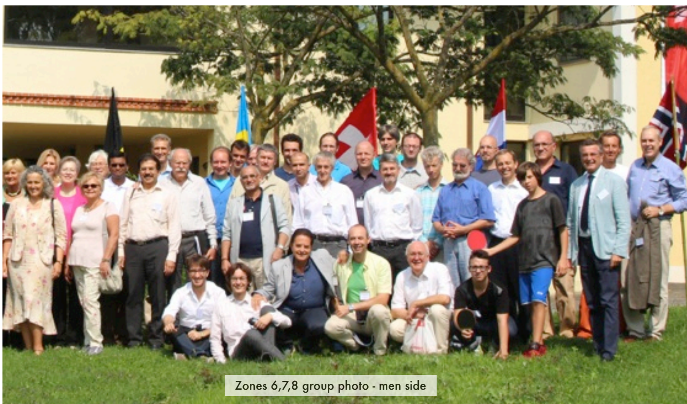
Zones 6,7,8 group photo - men side