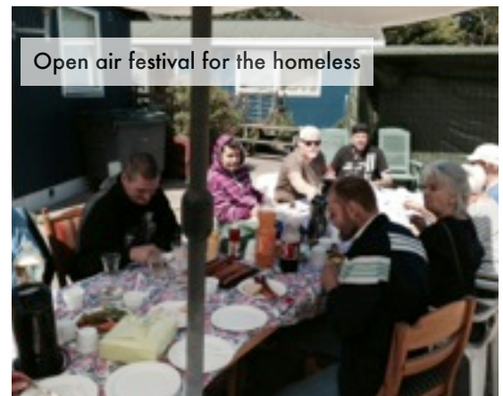
Open air festival for the homeless