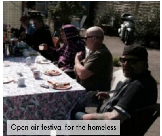
Open air festival for the homeless