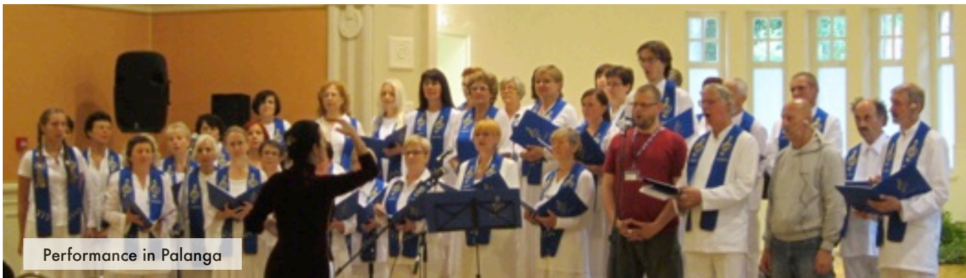
Performance in Palanga

The trip lasted for only eight days, but we felt that we were able to convey much joy to many people, and we ourselves received much more that we could ever imagine.