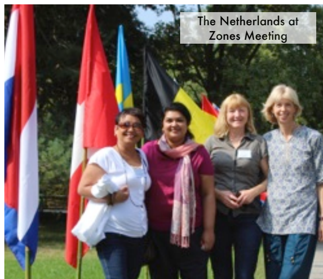
The Netherlands at Zones Meeting

More information is available in the Zone meeting minutes, available with your NCP.