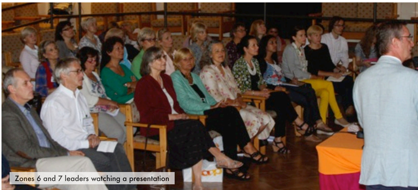
Zones 6 and 7 leaders watching a presentation

Yagna, pujas, and other religious ceremonies are not part of the SSIO activities. They can be