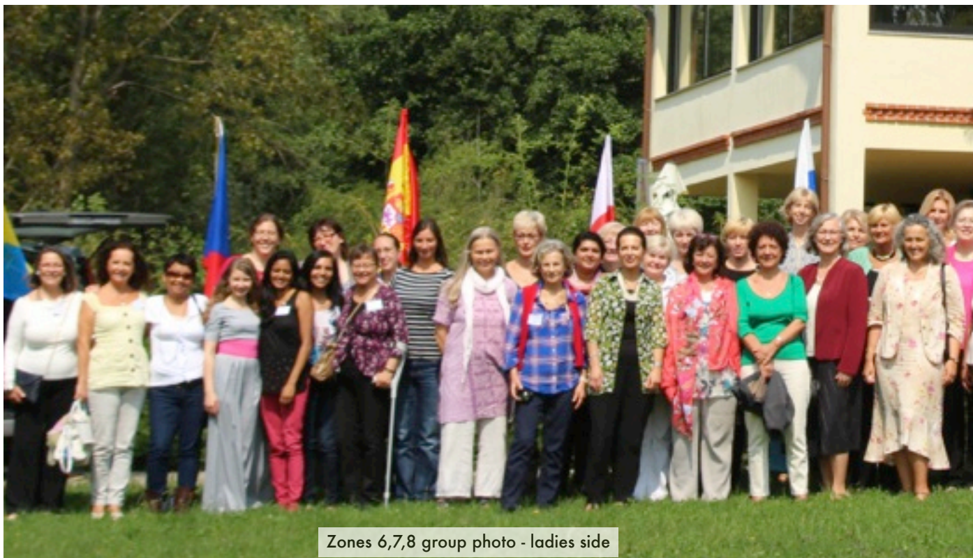
Zones 6,7,8 group photo - ladies side