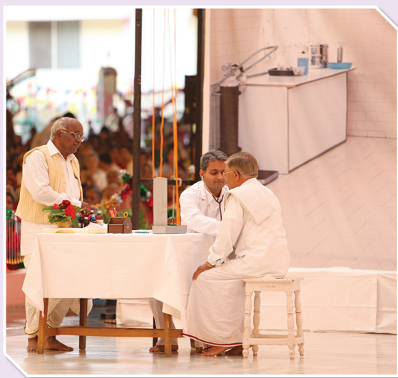
A beautiful drama was presented on the 56th anniversary of Sri Sathya Sai General Hospital on 4th October 2011.

4th October 2011 was the 56th anniversary of Sri Sathya Sai General Hospital, Prasanthi Nilayam. On this occasion, the doctors and other staff members of the hospital