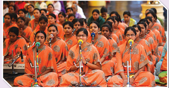
The students of Anantapur Campus of the Institute presented an enrapturing programme of devotional music on 2nd October 2011.

Equally enthralling was the musical presentation by the students of Anantapur Campus on 2nd October 2011. Beginning their presentation with “Saieswaraya Dheemahi” (we worship Lord Sai), the