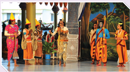
The drama presented by Sri Sathya Sai Seva Organisation of Tamil Nadu on 7th October 2011 highlighted the glory of Indian culture.

The drama entitled “Rama Rajyam Sai Samrajyam” (Rama’s kingdom is Sai Rama’s empire) based on the story of the Ramayana was presented by Sri Sathya Sai Seva Organisation of Tamil Nadu in Sai Kulwant Hall on 7th October 2011. The drama began at 5.00 p.m. with a song on the theme of the drama accompanied by a thrilling dance by a group of children. The story of the drama was then unfolded through a dialogue between