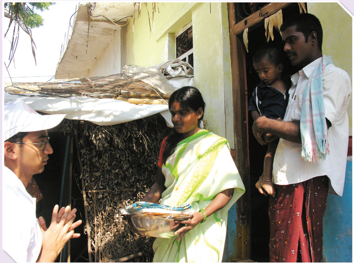
In the Grama Seva performed by the staff and students of Sri Sathya Sai Institute of Higher Learning, Bhagavan's Prasadam was offered to nearly 3,00,000 villagers at their doorstep with humility and love.

Kothacheruvu and Bukkapatnam Mandals, offering Bhagavan's Prasadam to nearly three lakh villagers. While the boys students of the Institute and 11th and 12th Class students of Sri Sathya Sai Higher Secondary School went to villages for distribution of Prasadam, the work of packing of the Prasadam was done by the students of Anantapur Campus of the Institute and also girls students of