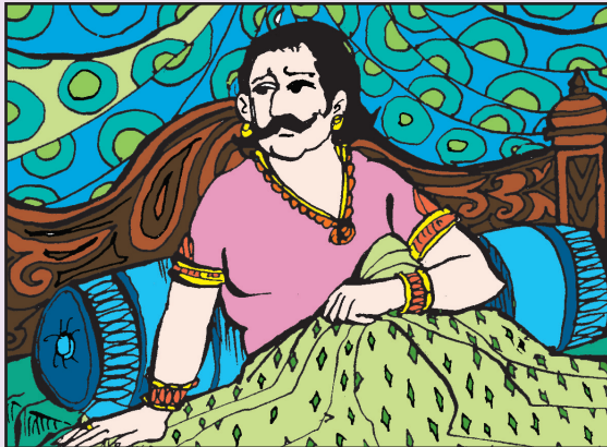
In his dream, King Janaka saw that he was forlorn and hungry in a forest.

W HILE CONVERSING WITH his ministers and courtiers after his supper one night, King Janaka felt a little tired and retired to his bedroom. The queen and royal servants served the king in many ways and he fell asleep. Seeing this, the queen gestured to the servants to go out while she herself sat near the king.