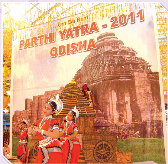
A scene from the drama "Konark" presented on 8th October 2011 by the students of Sri Sathya Sai Vidya Vihar, Baripada, Odisha.

construction and sacrifice of a 12-year-old boy who miraculously put the Kalasha atop the temple. The drama which began at 5.15 p.m. came to a close at 5.50 p.m.