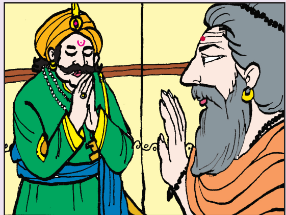
Sage Vasishtha told the king that neither the dream nor the waking state was true. What is present in both the states is true.

He said, “The king saw a dream in his sleep. What he saw in the dream was like this: He had lost his kingdom, and so was wandering in a forest. In the forest, he suffered from acute hunger and started shouting, ‘I am hungry, I am hungry.’ A group of thieves were eating something there. On seeing him, they thought, what a pity, this fellow looks like a king! And they offered him some food. When the king extended his hands to receive the food offered by the thieves, an eagle swooped down and snatched it away