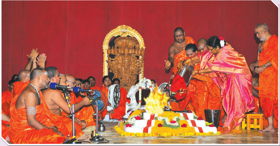
Veda Purusha Saptaha Jnana Yajna was performed in Poornachandra Auditorium from 30th September to 6th October 2011. The picture shows the scene of Poornahuti performed on 6th October 2011.

students left for Grama Seva while the priests continued the Yajna. The performance of the Yajna continued in this sacred manner for seven days, in which a large number of devotees and students took part daily.