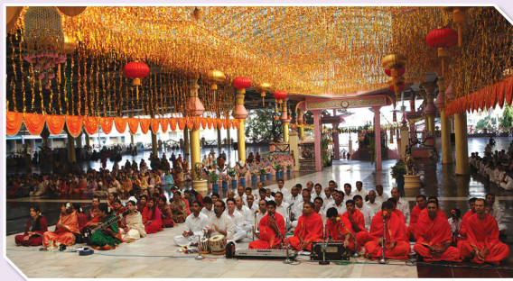
Sai Youth of U.K. presented an enrapturing programme of devotional music in Sai Kulwant Hall on 7th October 2011.

On the morning of 7th October 2011, the singers and musicians of the group presented a soulful programme of musical medley comprising Veda chanting, vocal and instrumental devotional music and Bhajans. They started their programme with Veda chanting at 8.00 a.m. followed by traditional prayer to Guru, after which a lady singer of the group sang a devotional song in English. This was followed by a scintillating instrumental musical presentation. Thereafter, they sang “Krishnam Vande Jagadgurum” (I