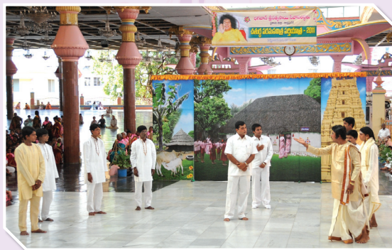
The drama presented by Sai Youth of Prakasam district on 25th September 2011 showcased the Educare philosophy of Bhagavan.

Sai Youth of Prakasam district presented a drama entitled "Seva Aradhana" (worship